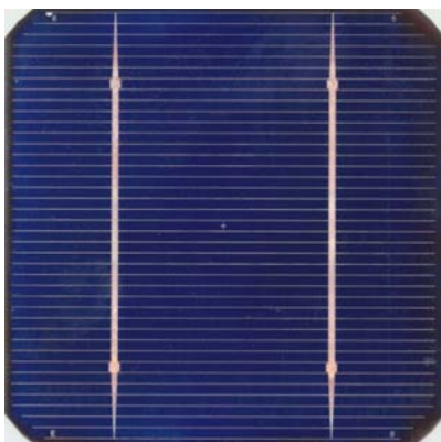
Figure 3. A finished solar cell with metal contact grid and anti-reflection coating

Furthermore, additional differences are evident between the 'average' reflectance spectrum of the finished cell (TS4; where the area sampled includes both cell surface and metal contact grid), and the spectrum of the cell surface only (TS4 Diff ssk; without reflectance contribution from the reflective metal contacts). This highlights the advantage of being able to reduce beam size to the point where it is small enough (~1 mm diameter) to allow the collection of spectra from an area between the metal contacts of the grid itself. Not surprisingly, the results confirmed the relatively high reflectivity of the metal grid compared to the 'active' surface of the cell itself.